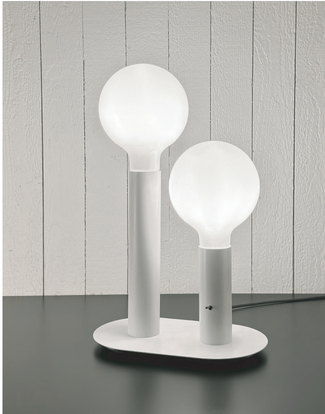
Table lamp Design 2024